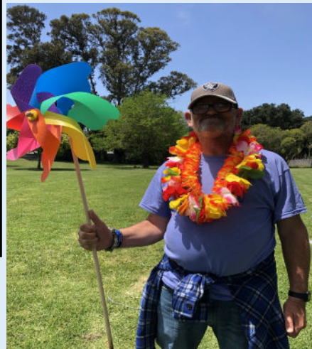
Enjoying Life Together!